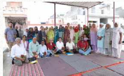
Field visit by IGS Board Members & Senior Management to Delhi