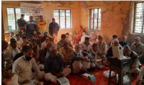
Soil and Land Structure Improvement training under the Rawta Green Revival project, Delhi