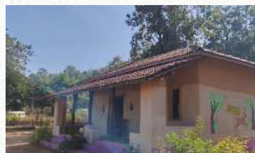
Tourists Experience a Homely Environment in Homestays