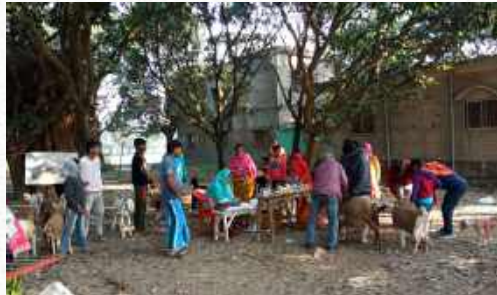
Animal health camp in different villages of Farakka block under SAMARTH project, West Bengal