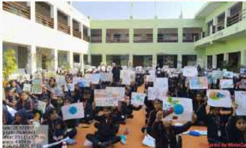
Drawing competition organized at New Krishna Model Public School, Rawta, under the Rawta Green Revival initiative, Delhi