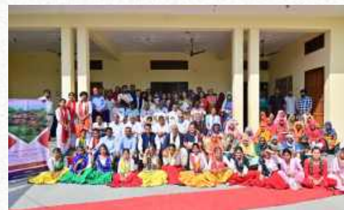
Launch event of the Project - Support Ecological Security and Livelihoods of Ghamroj and Alipur village at foothills of the Aravalli hills, Gurugram