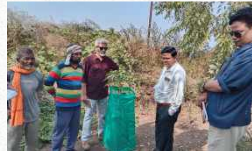
Evaluating the impact of bund plantation activities at Shivpur and Gujar Bhavali, Saakshyam Project, Maharashtra