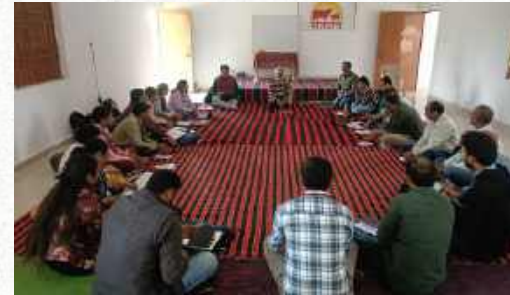
Visit of IGS Senior Leadership to Shwetdhara Project, Madhya Pradesh