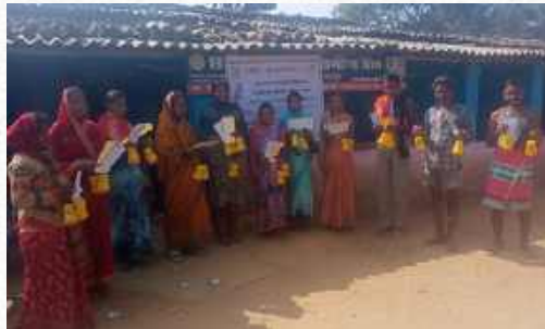
Farmer training and distribution of pheromone traps, yellow and blue sticky tapes to vegetable growers, HIMWP 2.0, Chhattisgarh.