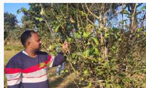
Exposure visit in Jaspur, apple, strawberry, and chikoo farming area with the North Regional Coordinator and team leader, HIMWP 2.0, Chhattisgarh