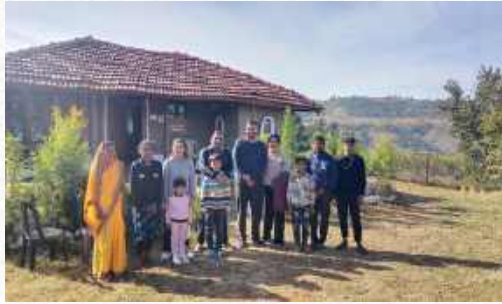
District Collector of Chhindwara and Zilla Panchayat CEO along with their families, experienced Kajra Homestay under Rural Tourism Project, MP