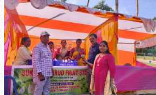
Sukinda Amrud FPC participated and displayed a Amrud Fruit Stall at Kharadi Gram Panchayat, Sukinda Block, Odisha