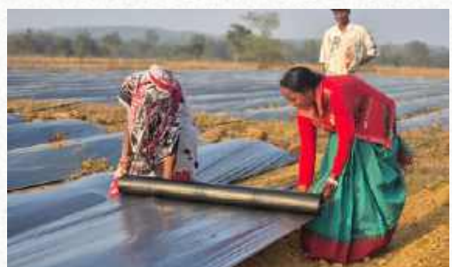
Poly mulching on Watermelon developed by PG members of Sabuja Khetra PG of Baria village under Sukruli Block, Odisha.