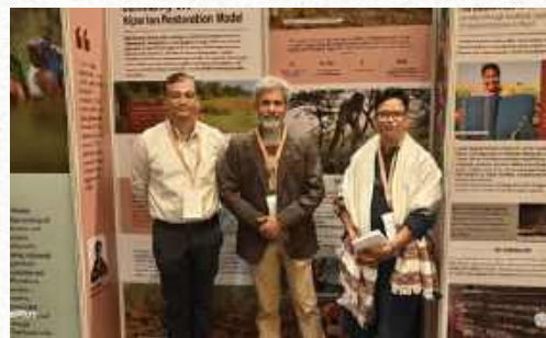
National Conclave RESTORE 2025 Accelerating India's Restoration Economy under Harit Bharat, New Delhi