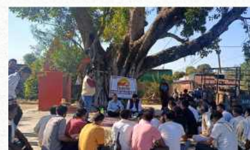
Village level training program, under Shwetdhara Project, Madhya Pradesh