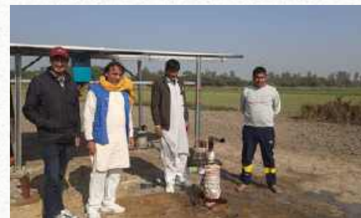
Solar-Powered Irrigation Launched in Rawta Village, Delhi