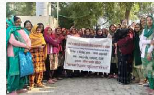
Training on best practices in waste management and sanitation, Rawta village, Delhi