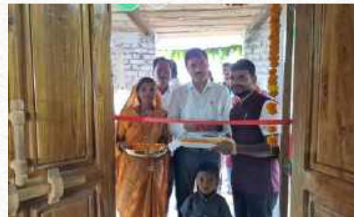
Inauguration of five newly developed homestays under the Rural Tourism Project, Madhya Pradesh