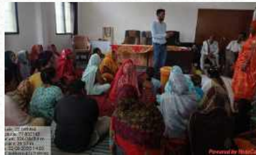
A training held on Sustainable Agriculture practices under the Restoration riparian area of Narmada river in Sukarbada village, Madhya Pradesh with 47 SHG women and farmers