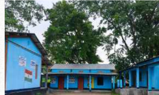
Creating Safe & Vibrant Learning Spaces in Rural Assam