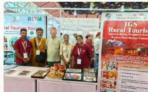
3-day TTF exhibition, at Yoshobhhomi IICC, Dwarka New Delhi