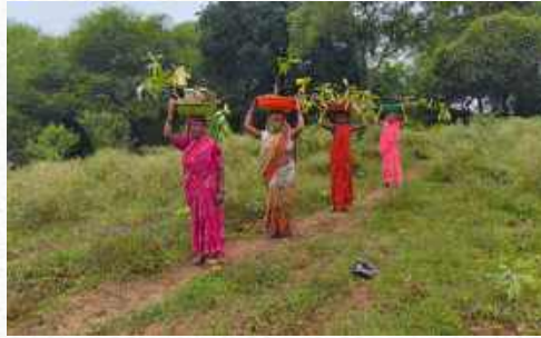
Plantation in Riparian area Under the Restoration riparian area of Narmada river Project Narmadapuram, Madhya Pradesh