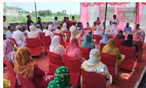
The inaugural session of the Livestock Health Campaign and Kitchen Garden Kit Distribution was successfully held in Rawta village, Delhi