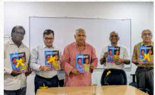
Launching the Annual Report for the year 2024-25