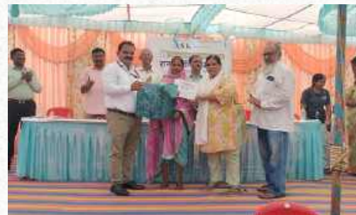
Wild Vegetable Festival (Ranbhaji Mahotsav) at Pawla under the Samruddha Kisan Project, Maharashtra