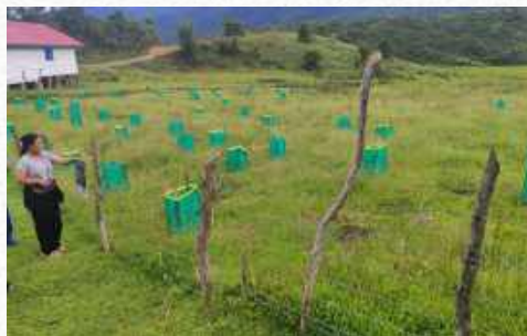
Orchard activity at Shi yomi Arunachal Pradesh