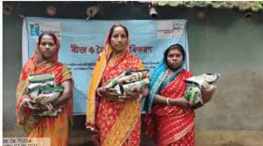
FPG Training Update – Biofertiliser & Biopesticide Awareness under SAMARTH Project , West Bengal