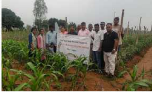
Two-day Livelihood Training Programme for CRP and CCs at Rajpur, Chhattisgarh