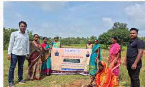
Single-day plantation campaign under APC Project, Sukruli at 26 no.s of different villages of Sukruli Block, Mayurbhanj District, Odisha