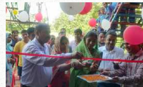
Inauguration of Flour Mill & Mustard Oil Plant at Kantpur Agro Farmers Producer Company Limited, Munger Sadar, Bihar