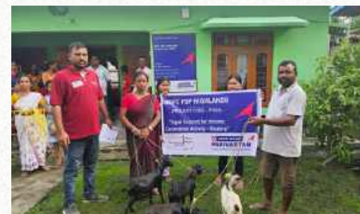
Goatery Activity to support sustainable livelihood development covering 5 villages under the HDFC-FDP Highlands Project at Naduar cluster, Assam