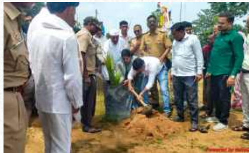
Ek Ped Maa ke Naam Initiative, Aamgaon, Maharashtra